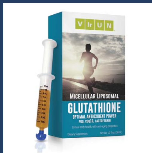
Our easy application syringe is able to give exact dosage measurements.