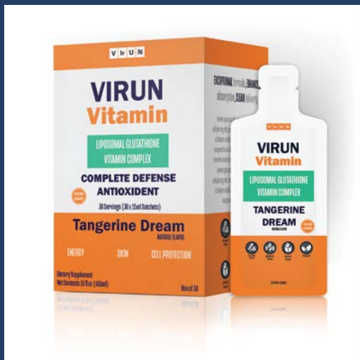
One serving satchets available in a box of 30.